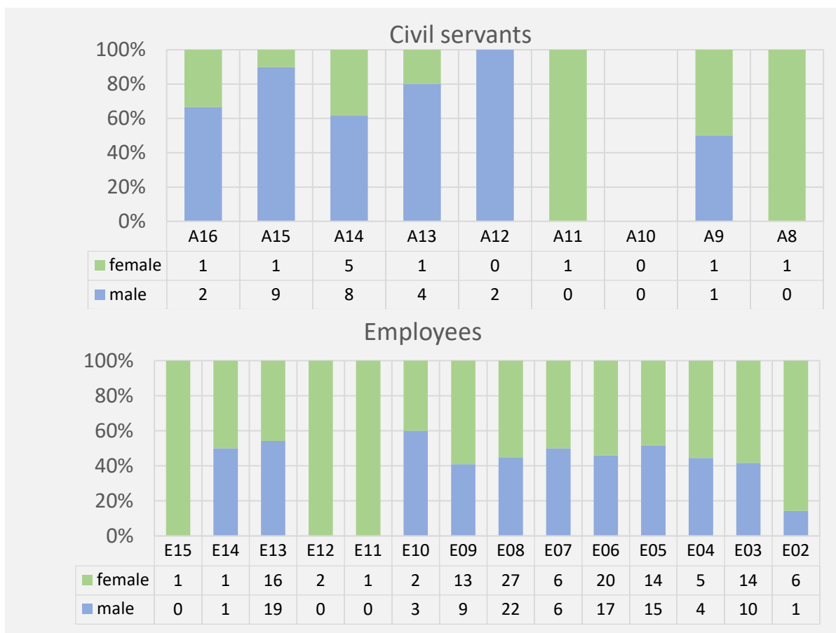
Figure 4: Percentage of women and men according to remuneration group in civil servant or employment.