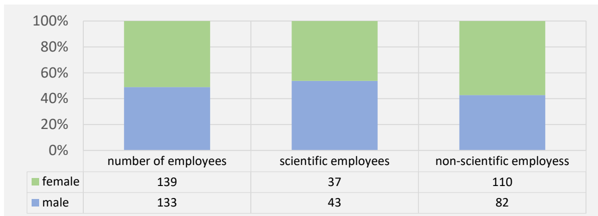
Figure 1: Percentage of women and men in (non-)scientific positions.

Indicators 1-3: Gender distribution among (non-)scientific employees